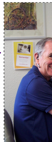
Volunteers for Love INC Jo