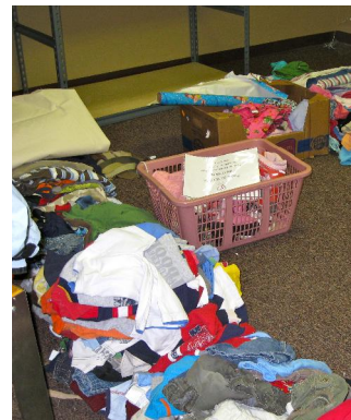
Kids Korner needs help with folding, and hanging adorable clothing.